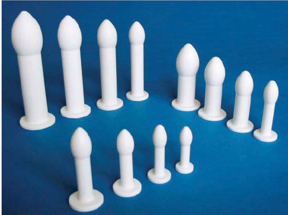
Vaginal Dilator Sets, Product ID: DT-A, DT-B, DT-C